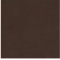
Painted metal Mat bronze