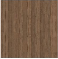
Veneered wood Walnut Canaletto