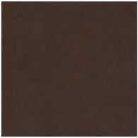
Painted metal Mat bronze