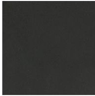
Painted metal Mat lead

Materials, fabrics, leathers, colors and finishes are approximate and may slightly differ from actual ones. You can find the complete collection of Bonaldo fabrics and leathers on the website