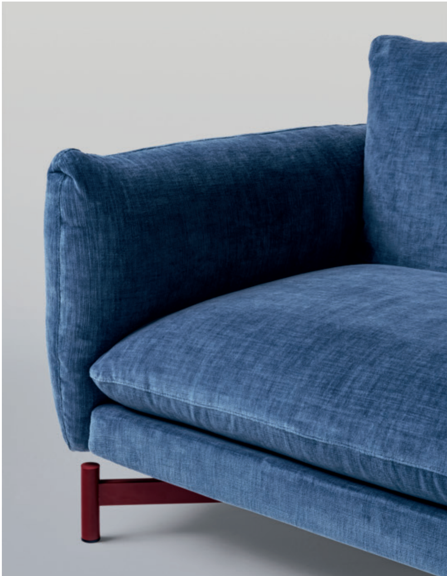
Kom, dettaglio divano / Kom, sofa detail